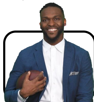
Player or Coach Guest Moderator Feature